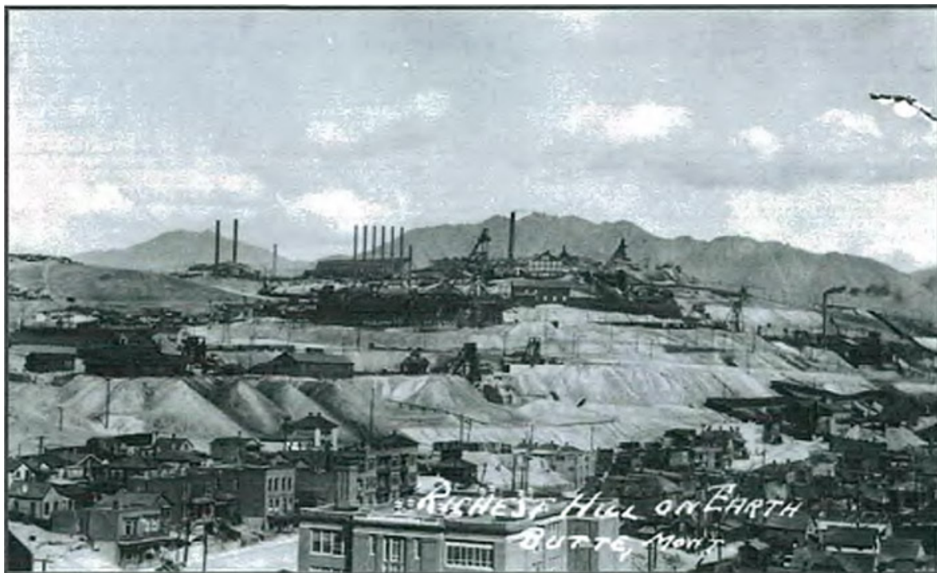
Figure 11-14. Historical photo of Butte Mining District

Although several chemicals of concern were identified at the site, this case study summarizes the risk characterization approach and results for lead. The sources of lead in the BPSOU are waste rock dumps, railroad beds constructed of mine waste, mine tailings, smelter emissions, and other mine-related materials associated with past Butte mining, milling, and smelting activities. Wind erosion and surface water runoff have also resulted in transport of lead to residential yards and parks.