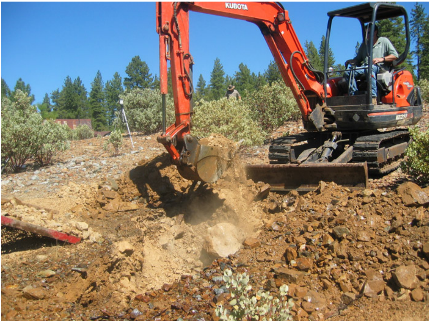
Figure 11-1. Empire Mine site waste rock pile

Empire Mine State Historic Park (EMSHP) is in Nevada County, California. The site is managed by the Department of Parks and Recreation and includes a visitor center with historic mine and mill buildings that serve as a museum for park visitors, as well as parking and picnic areas. In addition, 14 miles of trails throughout the park are used for hiking, jogging, biking, and horseback riding. Historical mining activities took place on the site for 100 years, leaving abandoned mine and mill operations throughout the park, and large piles of waste rock. More information is available in the site remedial action assessment ( Newmont 2013 ).